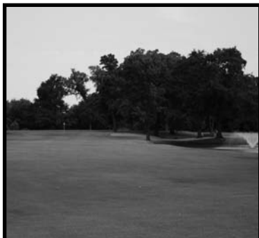
SHADY VALLEY GOLF CLUB