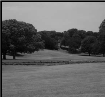
MEADOWBROOK GOLF COURSE