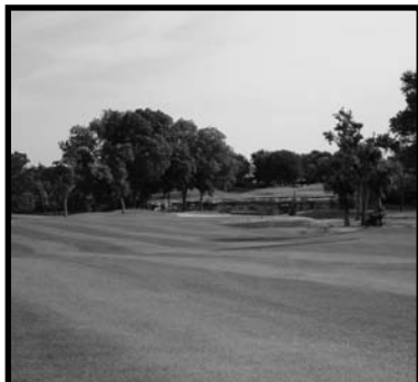
GOLF CLUB AT FOSSIL CREEK