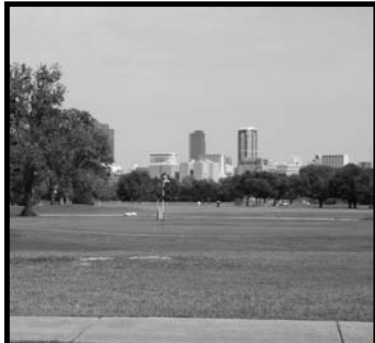
ROCKWOOD GOLF CLUB