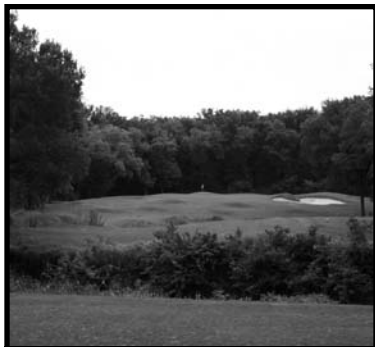
SOUTHERN OAKS GOLF CLUB