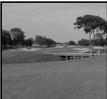
WHITESTONE GOLF CLUB