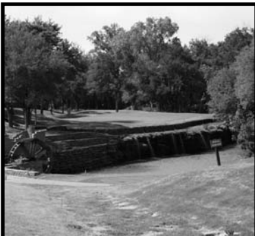
SUGARTREE GOLF CLUB