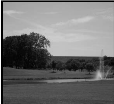
PECAN VALLEY GOLF COURSE