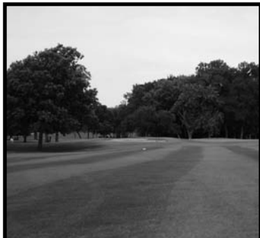
IRON HORSE GOLF COURSE