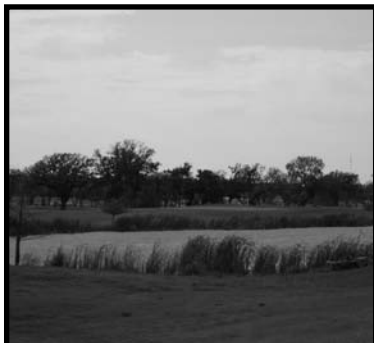
CROWN VALLEY COUNTRY CLUB