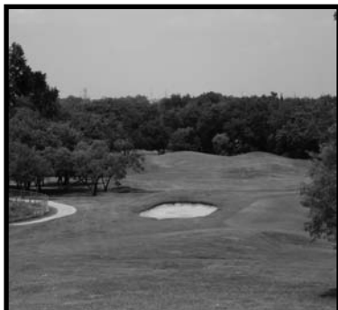
HIDDEN CREEK GOLF CLUB