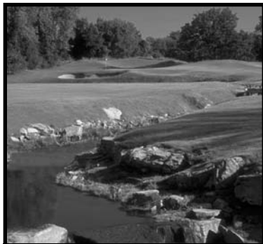
TEXAS STAR GOLF COURSE