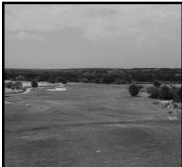
CANYON WEST GOLF CLUB