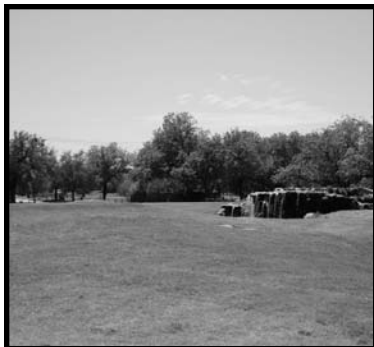
SPLIT RAIL GOLF CLUB