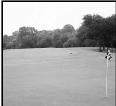
WOODHAVEN GOLF COURSE