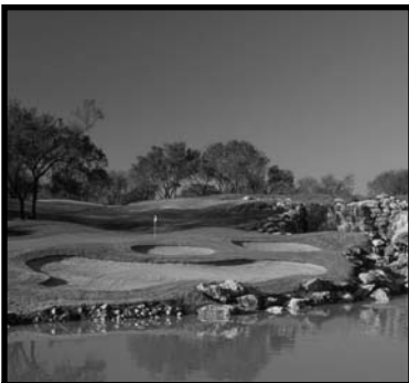
WATERCHASE GOLF CLUB