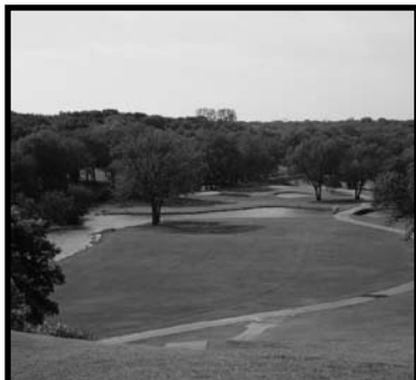
SQUAW CREEK GOLF COURSE