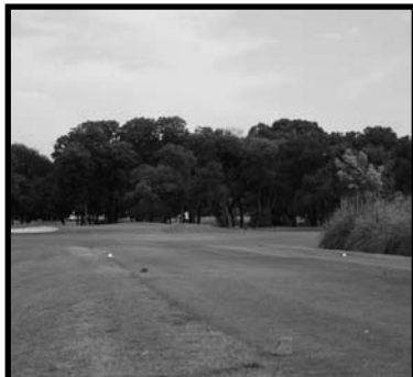
DIAMOND OAKS COUNTRY CLUB