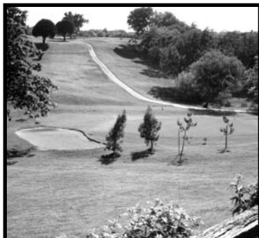
GLEN GARDEN COUNTRY CLUB