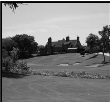
HAWK'S CREEK GOLF CLUB